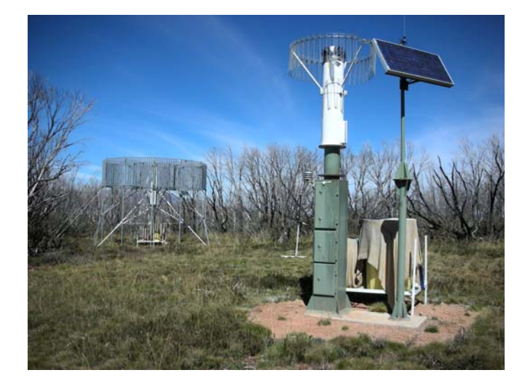
Figure 1.2 Grey Hill site, showing a pedestal (foreground) and tripod (background) pluviometer with and without wind fences (March 2007)

At the commencement of the trial in 2004, pluviometers were erected as pedestal structures designed to be removed at the conclusion of the trial. Pedestal pluviometers have been installed within disturbed areas. During the trial it has become necessary to install pluviometers at some additional locations. Additional pedestal pluviometers were constructed prior to the 2005 and 2006 seeding seasons. Several pedestal pluviometers were also removed prior to the 2005 season.